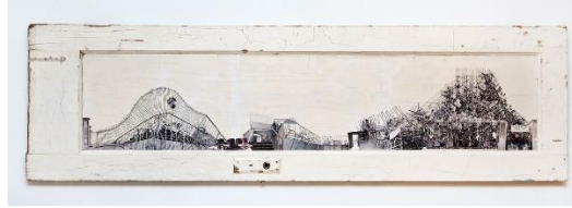
CAROLINE VOAGEN NELSON On The Fence , 2012 Digital transparency film; wood door 83" x 24"