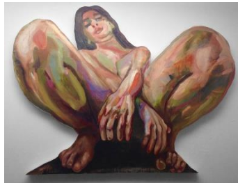
MAYA MASON Swerve , 2016 Oil on canvas mounted on panel 48" x 65" x 2.5"