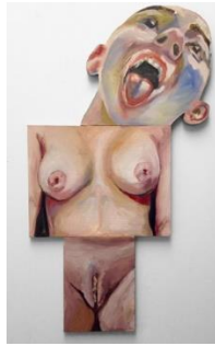
MAYA MASON Burgeoning , 2016 Oil on panel 41" x 21" x .5"