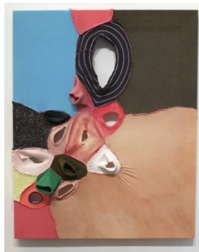
HANNA WASHBURN Openings I , 2016 Fabric, Thread 40" x 30"