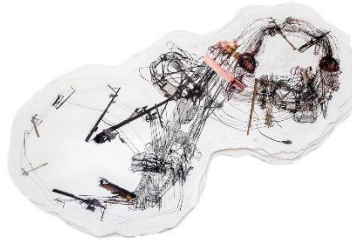
CAROLINE VOAGEN NELSON Power + Lines , 2012 Digital inkjet print, foam board, thread 35" x 63"